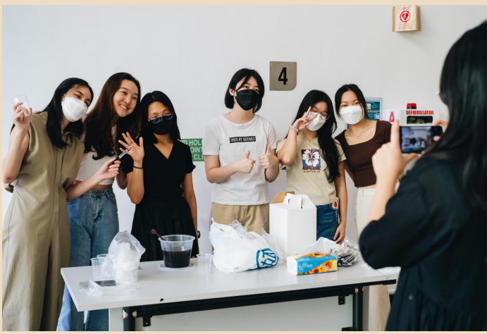
Photos (Clockwise from top): The TTB Bubble Tea (BBT) volunteers, BBT cup personalisation, distribution to the youths.